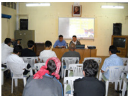
TCHRD's press conference on the video appeal

The Tibetan Centre for Human Rights and Democracy (TCHRD), on 28 August 2009 at 3:00PM organized a press conference at Lhakpa Tsering Hall, Department of Information and International Relations (DIIR) on the fresh videotaped information received from Tibet that appeal to the International communities to act swiftly on behalf of the Tibetan people who are victims of human rights violations in Tibet.