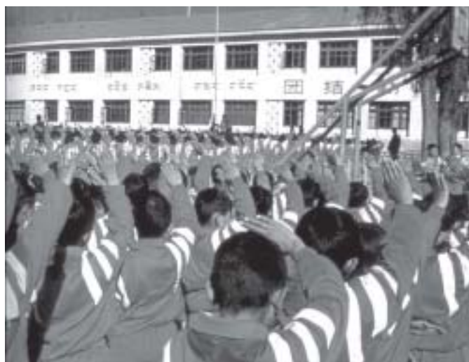
File photo: Tibetan children in assembly pledging their loyalty to the Party towns and cities, most of which is made up of ethnic Chinese and Chinese Muslims (Hui).

Notably, in the PRC as a whole, 57 percent of the population had a level of secondary education or above in 2003. Almost 50 percent of the population of Sichuan, which is the main source of Chinese migrants to the TAR, also have this level of education. In both cases, these education levels had improved since 2002. Seen in connection with worsening Tibetan levels, this indicates that the competitive educational disadvantages faced by Tibetans within their own towns and cities have continued to worsen with respect to the increasing out-of-province migration to these same