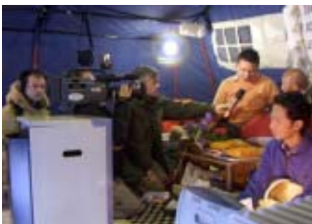
Media personnels seeking statements from the hunger strikers

The most recent statistics available for the Tibet Autonomous Region (TAR) reveal that the proportion of the local population that cannot read or write increased by more than 10 percent, to 54.9 percent in 2003, from 43.8 percent in 2002. This places the TAR against the trend in all other western provinces of the People's Republic of China (PRC), where illiteracy rates decreased in 2003, as in previous years. Similarly, the proportion of the population in the TAR with primary, secondary or tertiary levels of education also fell in 2003, meaning that the population was on the whole less educated in the 2003 survey than in the 2002 survey. Given that the surveys in the TAR mostly look at ethnic Tibetans, who account for over 90 percent of the registered TAR population, if these findings are even remotely accurate they indicate a marked failure of the Western Development Strategies of the PRC to improve education levels among