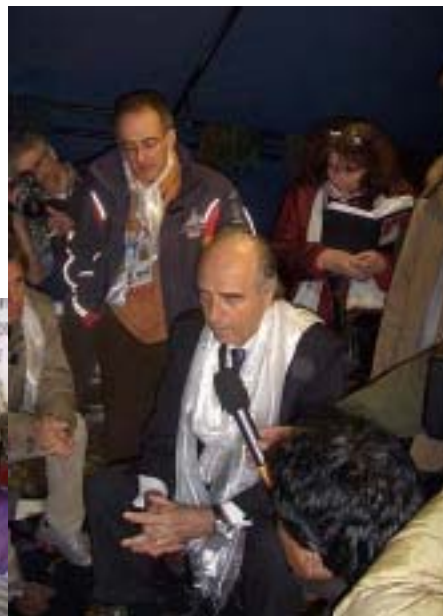
Mr. Mario Pescante, Executive Member of IOC and President of European Olympic Committee, addresses the press at the site of the hunger strike